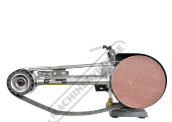
Adjustable Belt Tensioner