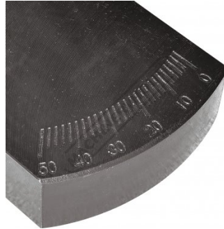
Adjustable Cutting Angle Up to 50 Degrees