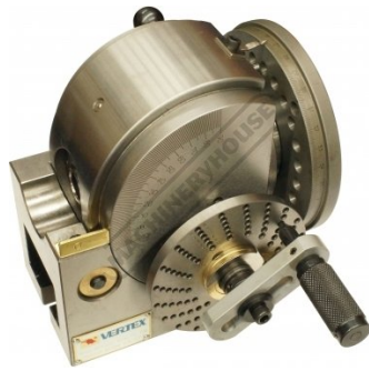
Left Rear View