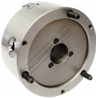
Chuck Rear View