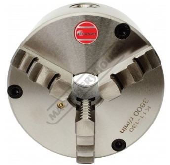
Chuck Front View