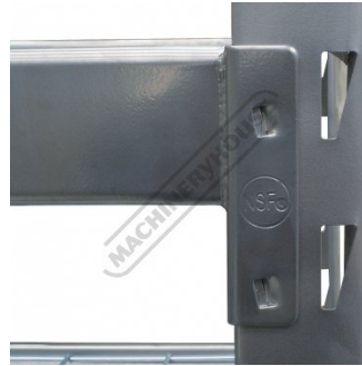
External Shelf Locking System