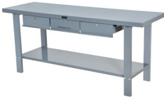
A380 Steel Work Bench - 3 x Lockable Drawers