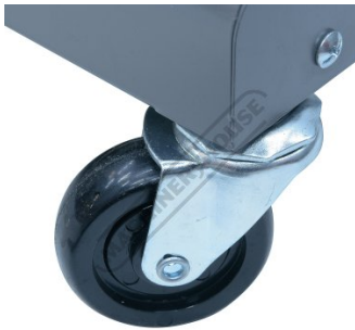
2 x Swivel Wheels