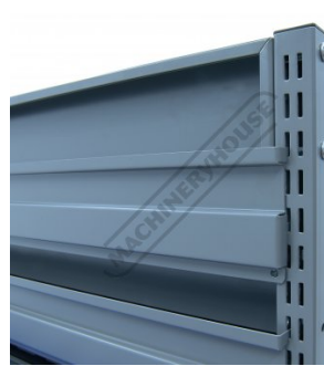
Bracket Securely Clipped Onto Frame