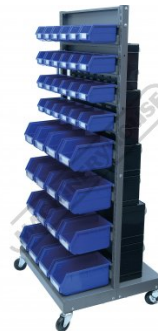
Shown with Optional BK-46MF Storage Bin System S0351