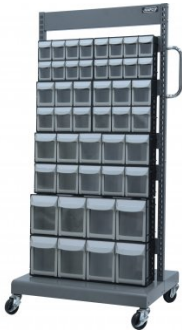
K200 Mobile Storage Bin Systems