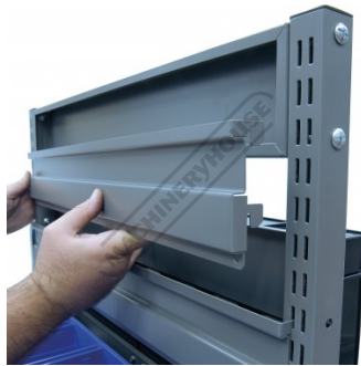
Bracket Shown Clipping Onto Frame