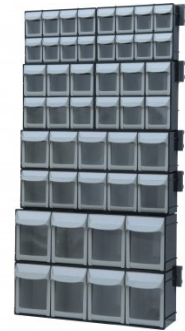
S0351 Parts Storage Bin System