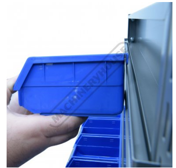
Bucket Shown Clipped Onto Bracket