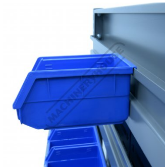
Bucket Shown Clipped Onto Bracket