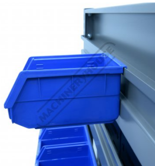
Bucket Shown Clipped Onto Bracket