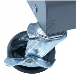
2 x Swivel Wheels with Brake