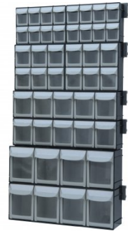
S0351 Parts Storage Bin System