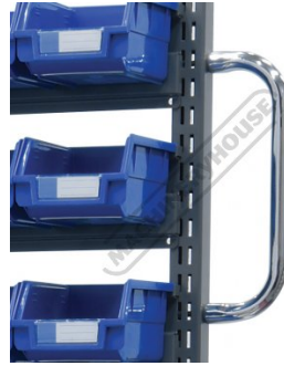
Chrome Handle Mounts on Left or Right Side