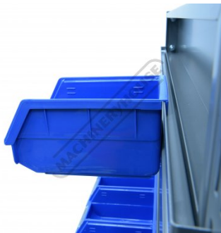
Bucket Shown Clipped Onto Bracket