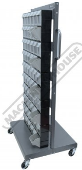
Right Side View Two Buckets Open