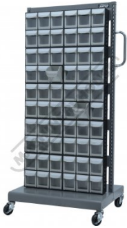
Few Buckets Shown Open