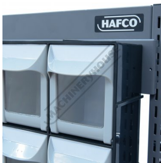
Medium Size Bins