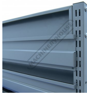
Optional Bracket Securely Clipped Onto Frame