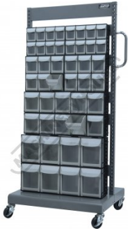
Few Buckets Shown Open