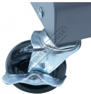
2 x Swivel Wheels with Brake