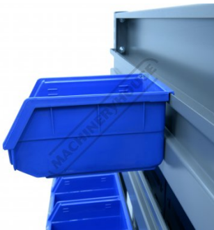
Optional Bucket Shown Clipped Onto Bracket