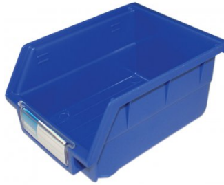
A432 Plastic Bucket