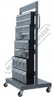
Right Side View Two Buckets Open