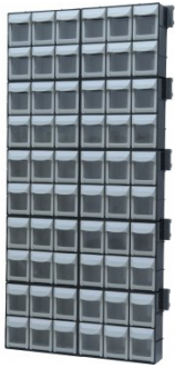
S0353 Parts Storage Bin System