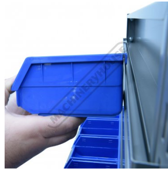
Optional Bucket Shown Clipped Onto Bracket