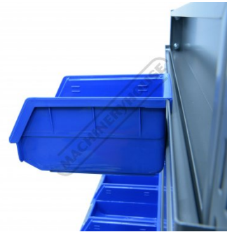
Optional Bucket Shown Clipped Onto Bracket