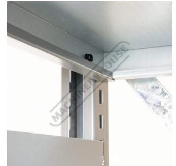
Shelf Support Inside View