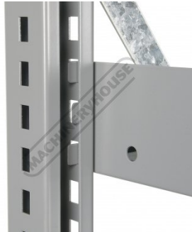
Shelf Support Clip In Design