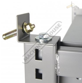
2 Wall Mount Brackets