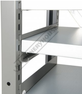
Shelf Support Clip Lock Design