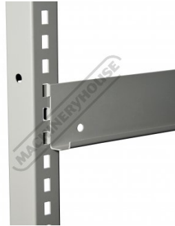
Shelf Support Clip In Lugs