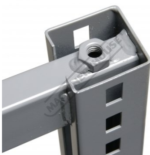
Wall Mount Bracket Bolting Point