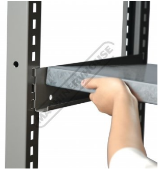
Clip In Lock Shelf Design