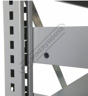
Shelf Support Locking Plug