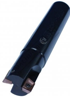
End View M521