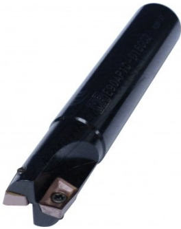
End View M520