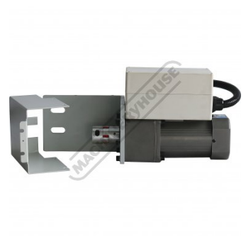
Drive Shaft Coupler Connector