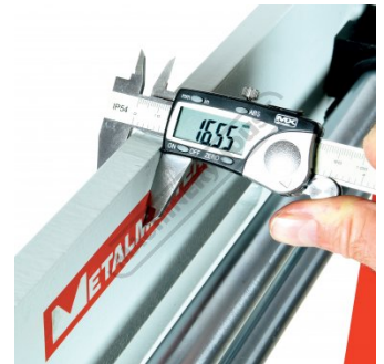
16mm Plate Steel