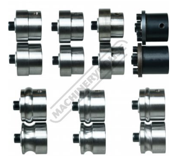
Side Profile View Of Die Sets