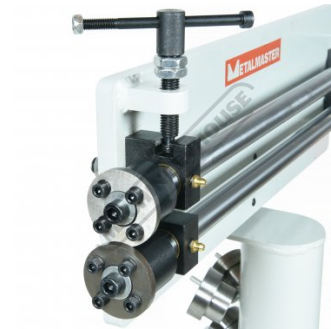
Top Roll Height Adjustment Handle