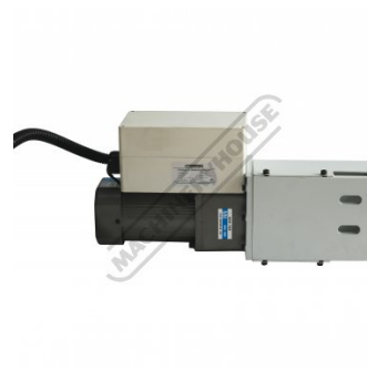
Variable Speed Drive Motor