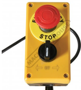
Emergency Stop-Forward-Reverse Switch