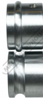
1.4 6.35mm Beading Dies