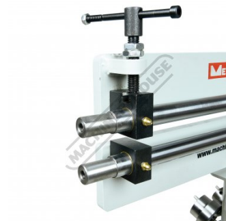
22mm Spigot for Mounting Rollers