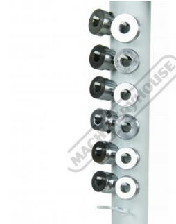
Rolls Stored on Stand