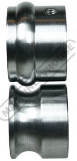
1.2 12.7mm Beading Dies