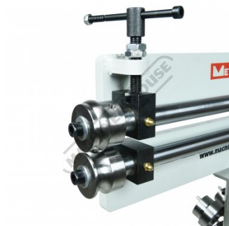
Shown With 1.2.12 Beading Dies