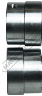
1.16 1.6mm Stepped Dies