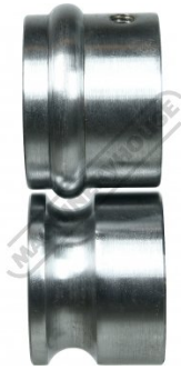
3.8 9.5mm Beading Dies