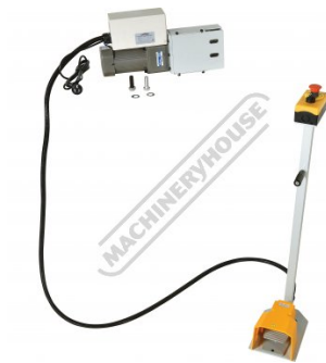
Motor Kit Assembly