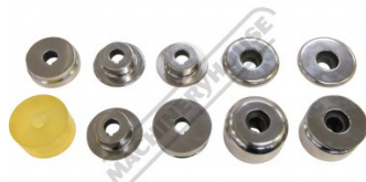
MBR-10K - Forming Bead Roller Kit