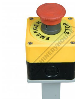
Emergency Stop Close Up