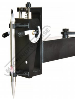
Trace Pen In Holder