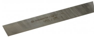
L072 HSS Turning Tool Set - 4 piece