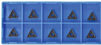
L062 KYOCERA Carbide Inserts - Turning