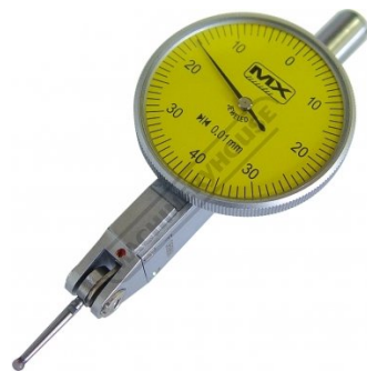
Dial Test Indicator