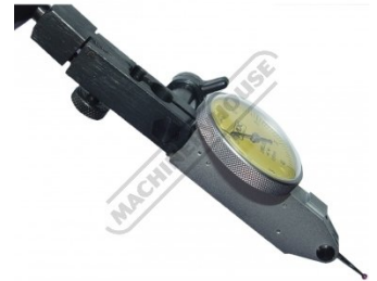
Shown holding optional Dial Indicator