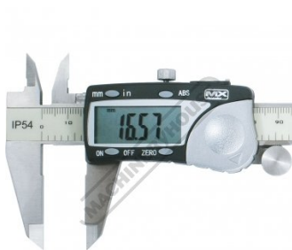
Front Close Up