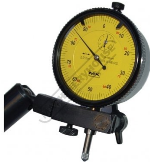
Shown holding optional Dial Indicator