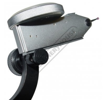
Shown holding optional indicator with Dovetail Slide clamp