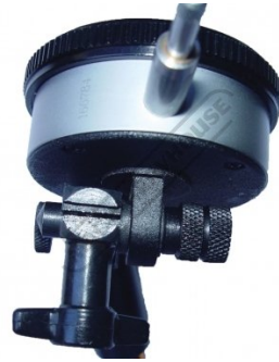
Shown holding optional Dial Indicator