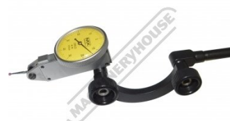
Shown holding optional indicator