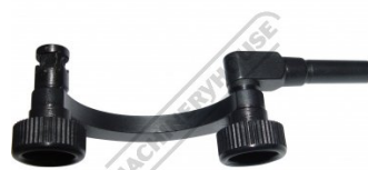
Dial Indicator Holder