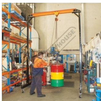
Shown Lifting Oil Drum 2