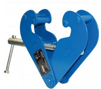
C146 Girder Clamp