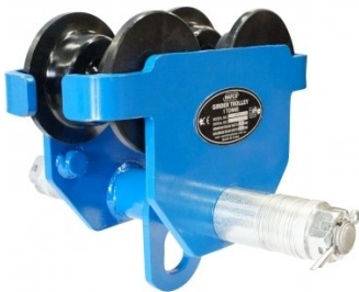
C147 Girder Trolley