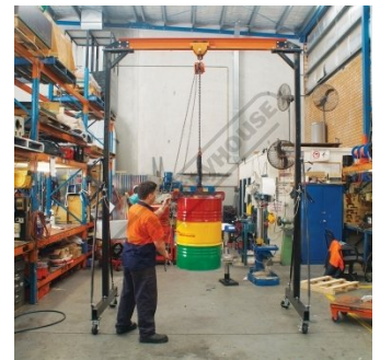
Shown Lifting Oil Drum