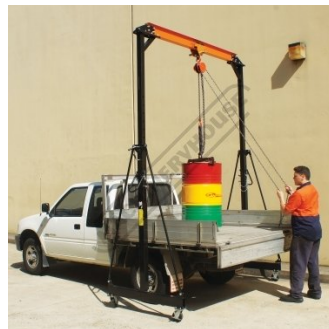
Shown Loading Oil Drum onto Ute