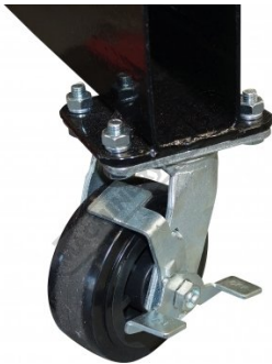
Swivel Wheels with Lock