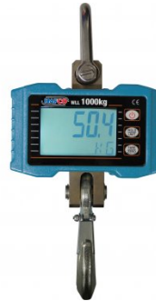
C191 Digital Crane Scale