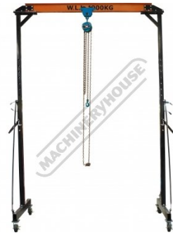
Shown at Full Height