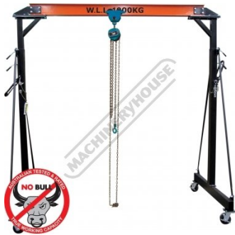
Mobile Girder Rail