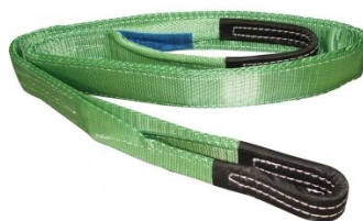
H322 Flat Sling