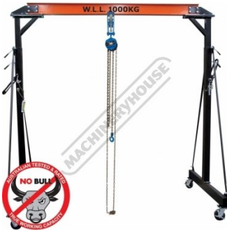
K090 Mobile Girder Rail Gantry Package Deal