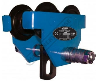
Includes 1T Girder Trolley