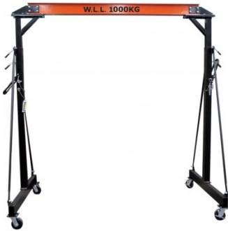
C188 Mobile Girder Rail Gantry