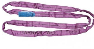
H305 Round Sling