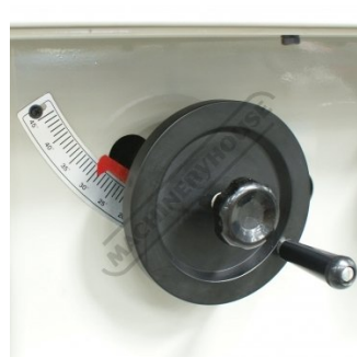
Blade Height Adjustment Handle and Angle Scale