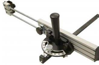
W308 Mitre Gauge & Fence