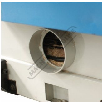
100mm Dust Chute