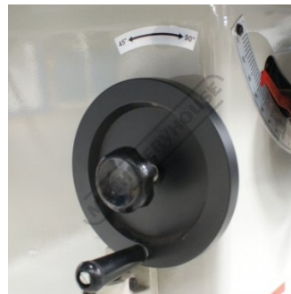
Tilt Arbor to 45 degrees