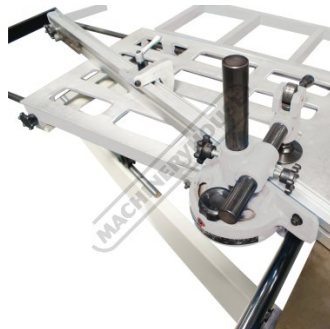
Sliding Table with Mitre Guide and Material Clamp