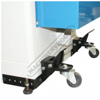
Swivel Wheels on Mobile Base with Leveling Screws