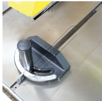
Heavy Duty Mitre Guide 60 degrees