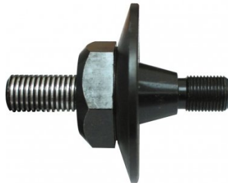
KA0999 DADO BLADE INSERT