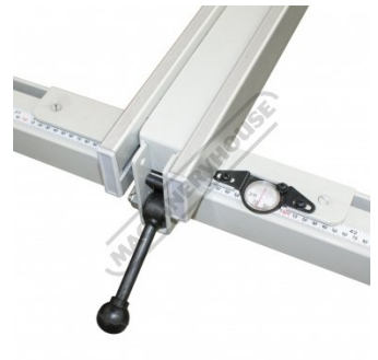
Single Lock Lever on Rip Fence with Magnified Scale