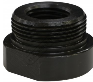
SCI 10 Scroll Chuck Insert