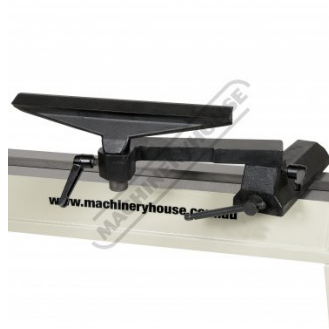
Outrigger Tool Rest