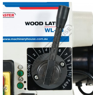
Variable Speed Lever