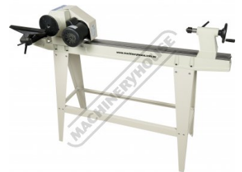
Bowl Turning Setup Right View