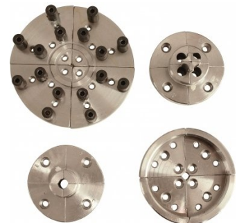
W375 Scroll Chuck Accessory Kit