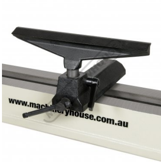
Standard Tool Rest