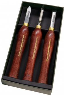
W3033 HSS Pen Turning Tools - 3 Piece Set