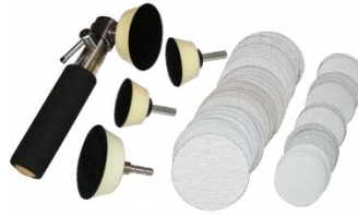
W305 Bowl Sanding Tool