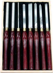
WT 8 HSS Wood Turning Tool Set