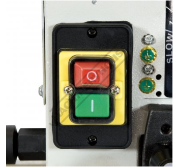
Switch On Off