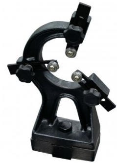
W378 Roller Steady