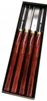
W3039 HSS Wood Turning Tools - 4 Piece Set