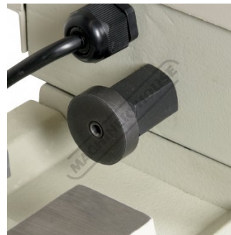
Swivel Head Release Lock