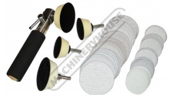
BSS 5075 Bowl Sanding Tool