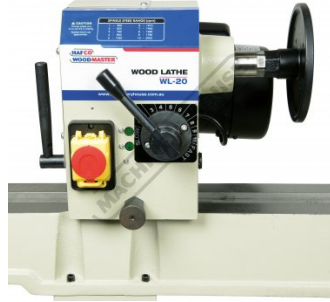
Headstock Front View