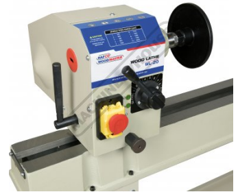
Headstock Left Top View