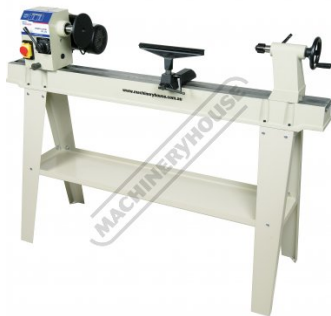
Shown with Standard Tool Rest