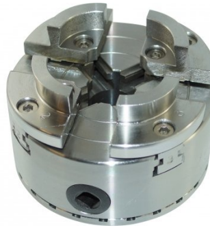
W375 Scroll Chuck Accessory Kit