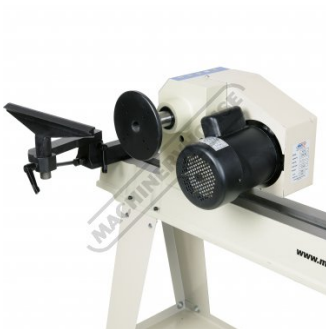
Bowl Turning Set Up Right View Close Up