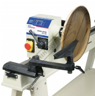
Shown Set Up with Bowl