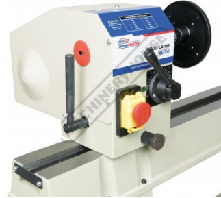
Headstock Left View