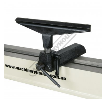
Standard Tool Rest