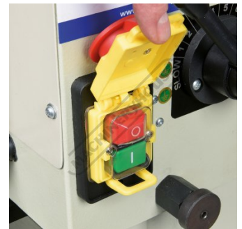
Switch On Off