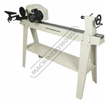
Bowl Turning Set Up Right View