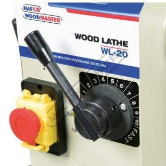
Variable Speed Lever