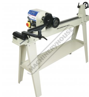
Bowl Turning Set Up Left View