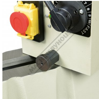
Swivel Head Release Lock