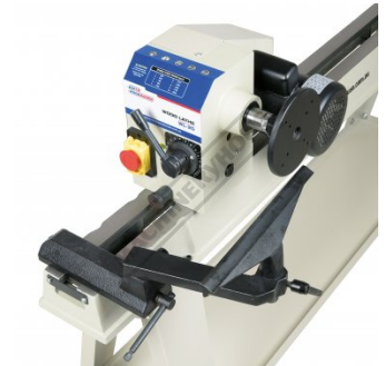
Bowl Turning Set Up Top View