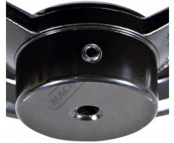
Grub Screw Attachment