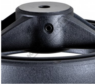
Grub Screw Attachment