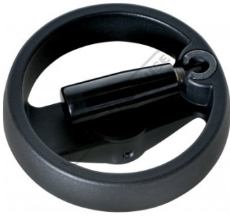
Handle Folded Flat