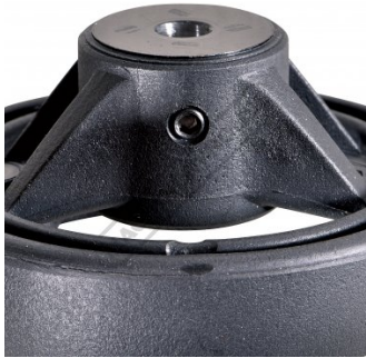
Grub Screw Attachment