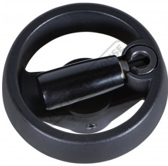
Handle Folded Flat