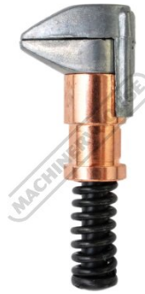
Shown with Optional Cleco Fastener Pliers H8500 Side Grip Clamp