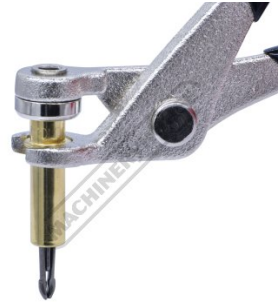
Shown in Cleco Fastener Pliers