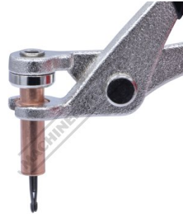
Shown in Cleco Fastener Pliers