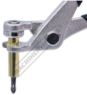
Shown using a Cleco Fastener