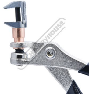
Shown using a Side Grip Clamp