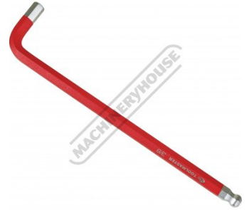
Imperial Hex Key