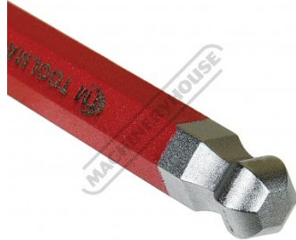
Ball End Hex Profile