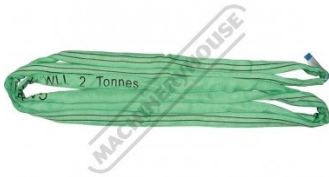
H312 Round Sling