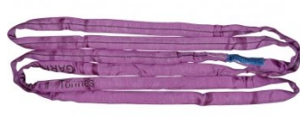
H307 Round Slings