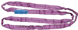
H308 Round Slings