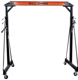
C188 Mobile Girder Rail Gantry