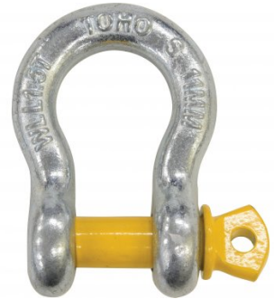
H350 11mm 1.5T Grade S - Lifting Bow Shackle