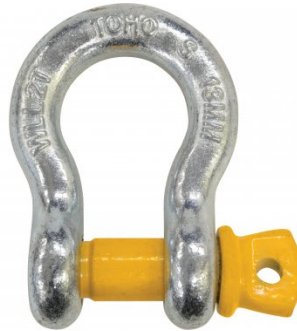
H352 13mm 2T Grade S - Lifting Bow Shackle