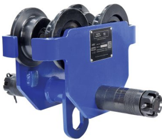
C147 Girder Trolley