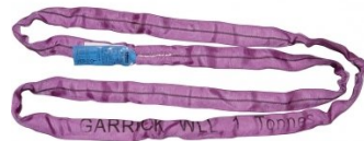
H308 Round Sling