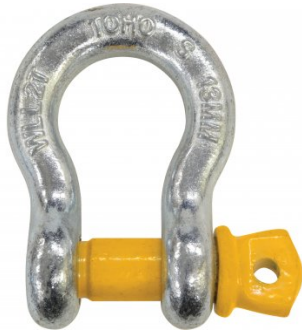
H352 13mm 2T Grade S - Lifting Bow Shackle