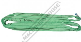
H312 Round Sling