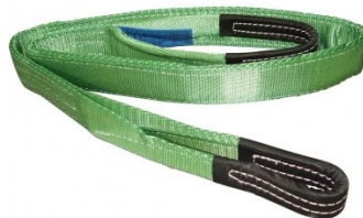
H322 Flat Sling