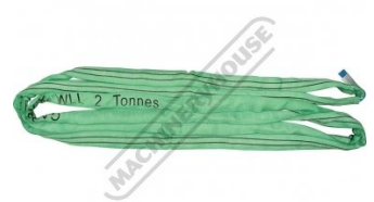
H312 Round Sling