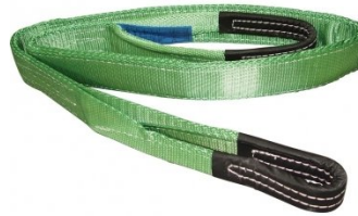
H322 Flat Sling