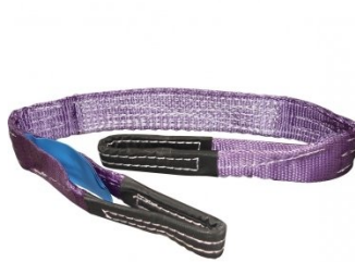
H316 Flat Sling