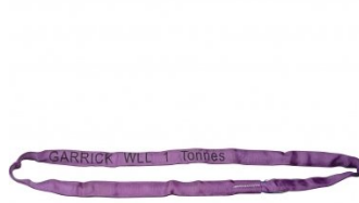
H300 Round Sling