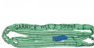
H310 Round Sling