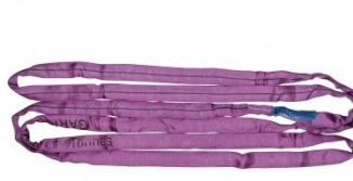
H307 Round Sling