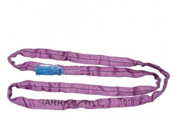
H305 Round Sling