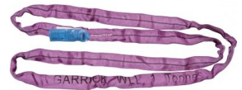
H305 Round Sling