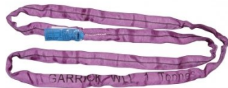
H308 Round Sling