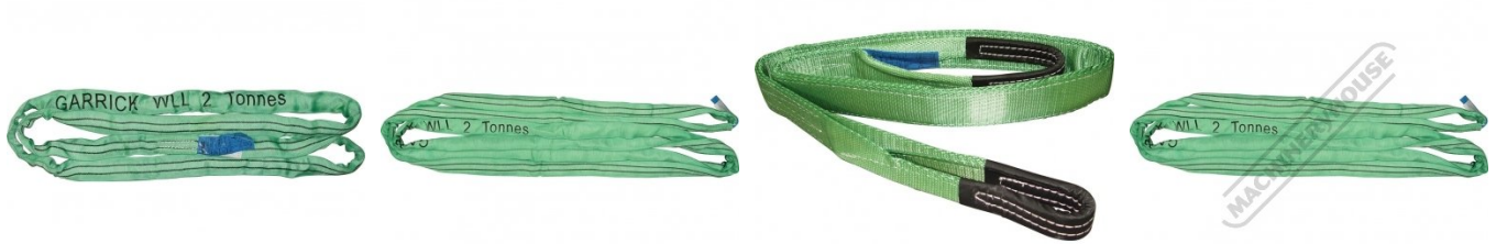
H324 Flat Sling