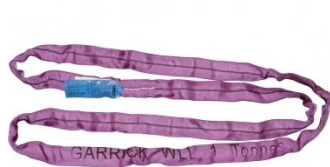
H308 Round Sling