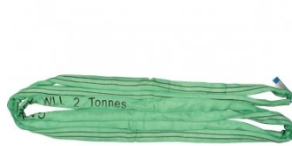
H314 Round Sling