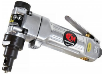
A082 Air Nibbler