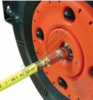
Hose Reel Connection