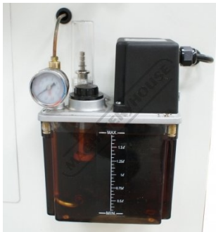
Auto Lubrication Pump