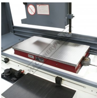
Electro Magnetic Chuck