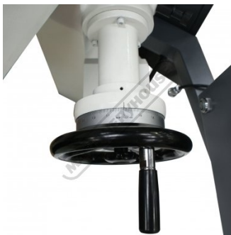
Fine Feed Height Adjustment Dial