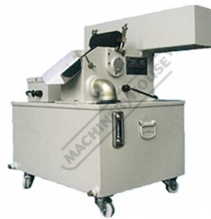
Coolant Pump Tank & Magnetic Separator