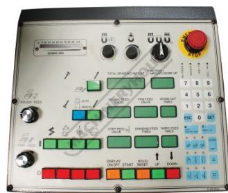
Programmable AD5 Controller