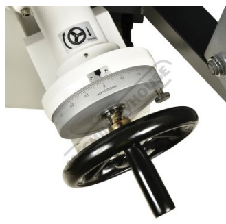
Fine Feed Height Adjustment Dial