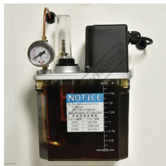
Auto Lubrication Pump