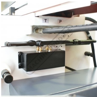
Table Direction Micro Switches