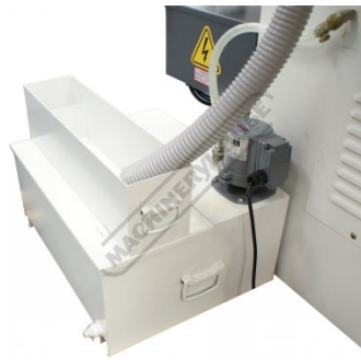
Outlet Pump & Tank (see back page) *Auto Chosen in Feature 1, Outlet Pump & Tank (if) Please refer to the 107 and 107 (opt) / 107