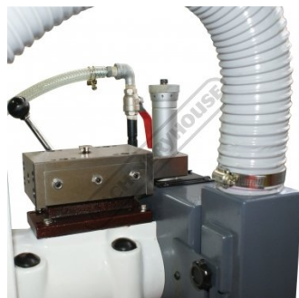
Parallel Wheel Dresser Micro Adjustment