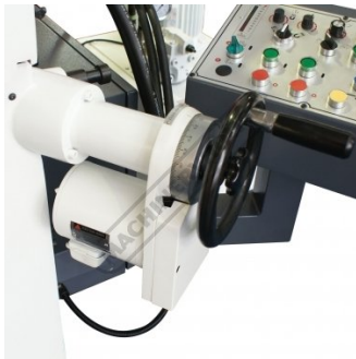
Fine Feed Height Adjustment Dial