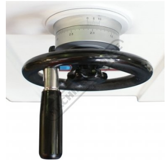
Cross Feed Dial