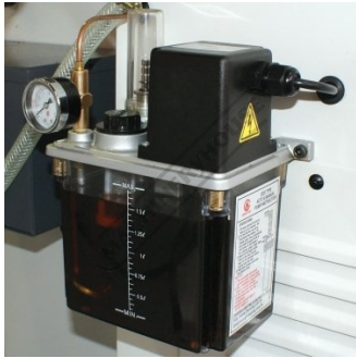
Auto Lubrication Pump