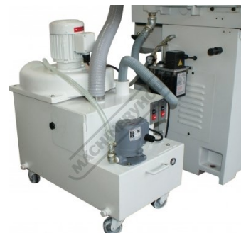
Optional Dust Collection System