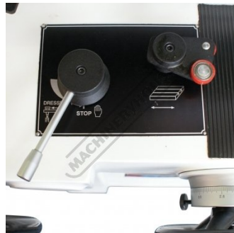
Hydraulic Table Feed Control with Rapid