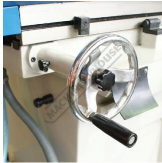
Manual Table Feed Hand Wheel