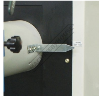
Height Upper Limit Guide