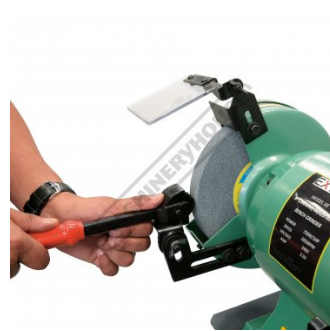
Setup for Dressing a Grinding Wheel