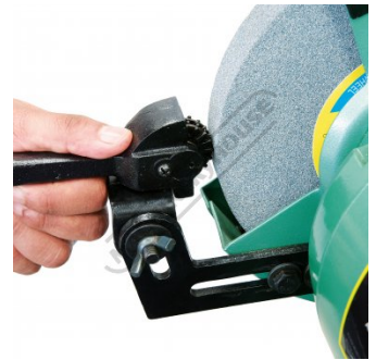
Setup for Dressing a Grinding Wheel Close Up