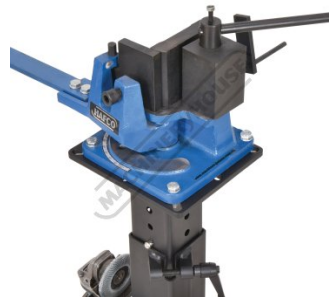
Top View with Optional Bar Bender