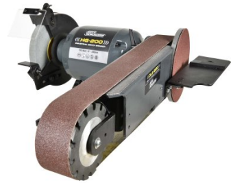
K4018 Industrial Bench Grinder with Deluxe Linisher Package Deal