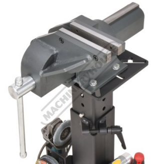
G180 Top View with Optional Vice 1