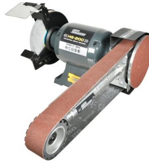
K4014 Industrial Bench Grinder with Linisher Package Deal