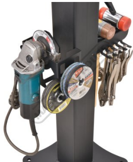
Grinder Holder Shown with Optional Tools