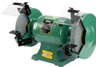
G160 Industrial Bench Grinder