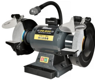
G144 Deluxe Industrial Bench Grinder