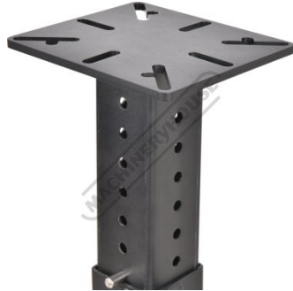
10mm Thick Mounting Plate