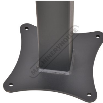
Heavy Duty Base Plate