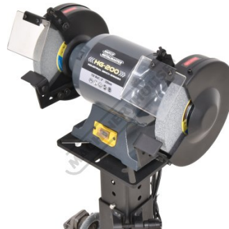
G180 Top View with Optional Grinder