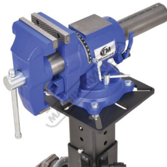
Top View with Optional Vice 2