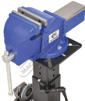
Top View with Optional Vice 3