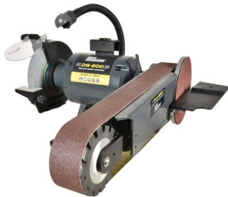
K4022 Deluxe Industrial Bench Grinder with Deluxe Linisher Package Deal