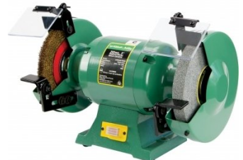
G160A Industrial Bench Grinder