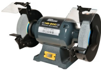
G142 Industrial Bench Grinder