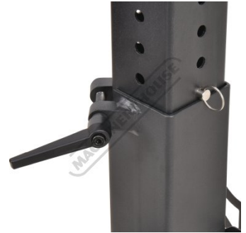
Positive Locating Pin Quick Release Bolt