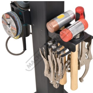
Tool Holder Shown with Optional Tools