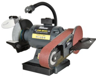
K4021 Deluxe Industrial Bench Grinder with Deluxe Linisher Package Deal