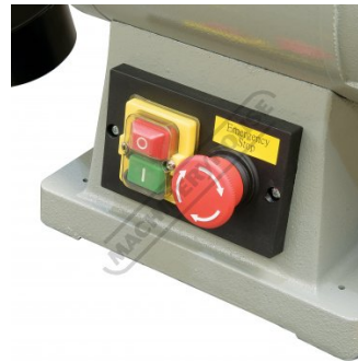
Safety Magnetic Switch Right View