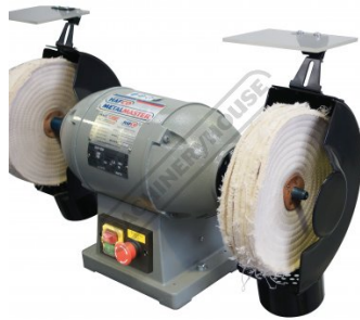
Buffing Wheel Safety Shield and Dust Chute