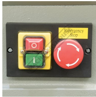
Safety Magnetic Switch