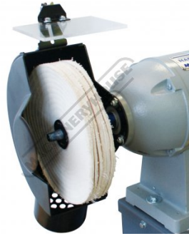
Buffing Mop and Guard