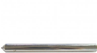
G189 0.5CT Grinding Wheel Dresser - Industrial Diamond Type