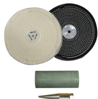
G185 Buffing Kit