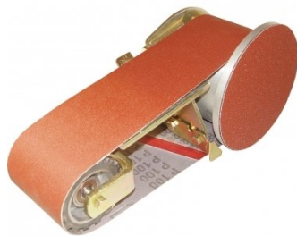
L087 Multitool Belt & Disc Linishing Attachment