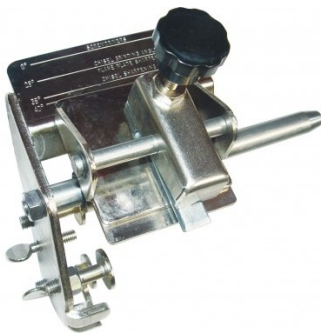
L083 Multitool Chisel Sharpening Jig