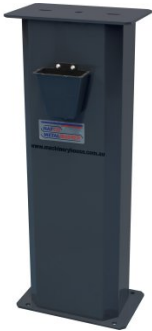
G182 Bench Grinder Stand