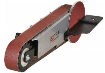
L0912 Industrial Belt & Disc Linishing Attachment