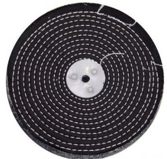
G186 Buffing Mop