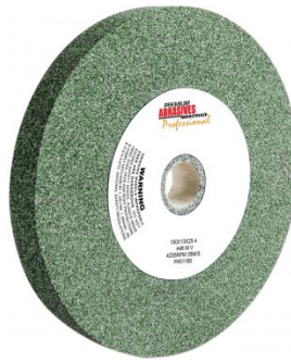
G170 Silicon Carbide Grinder Wheel