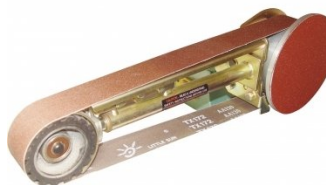
L088 Multitool Belt & Disc Linishing Attachment