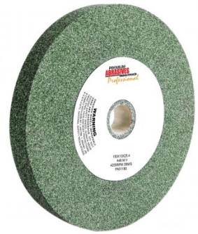
G170 Silicon Carbide Grinder Wheel