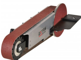
L085 Multitool Belt & Disc Linishing Attachment