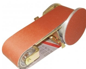
L088 Multitool Belt & Disc Linishing Attachment