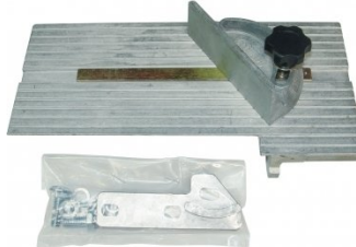
L086 Multitool Tilting Table & Mitre Guide