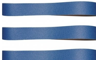
A8009 40G Zirconia Linishing Belt Pack