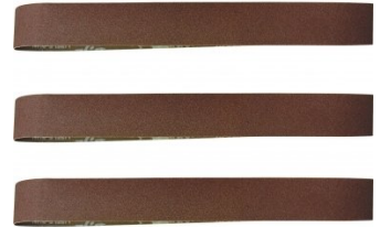
A8000 40G Aluminium Oxide Linishing Belt Pack