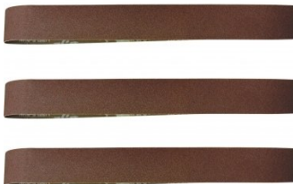
A8001 60G Aluminium Oxide Linishing Belt Pack