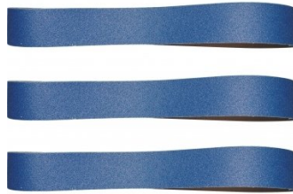
A8012 100G Zirconia Linishing Belt Pack