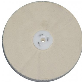
G186A Buffing Mop