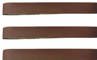
A8006 400G Aluminium Oxide Linishing Belt Pack