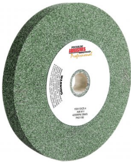
G170 Silicon Carbide Grinder Wheel