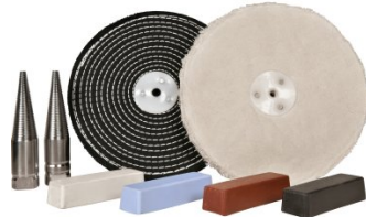
G1855 Buffing Kit