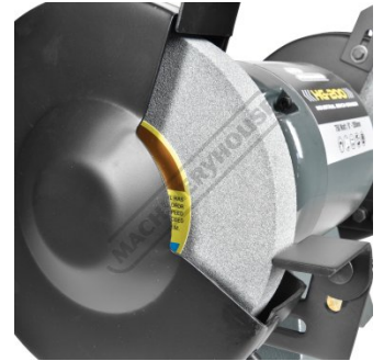
Fine Aluminium Oxide Grinding Wheel