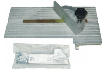
L086 Multitool Tilting Table & Mitre Guide