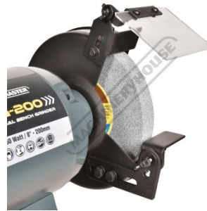
Adjustable Eye Shield-Tool Rest