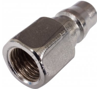
1/4" BSP Female End