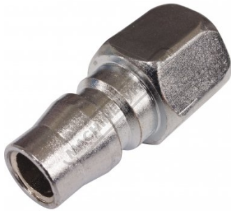
Hi Flow Adaptor