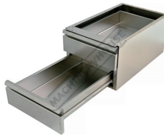
Large Draw Opening