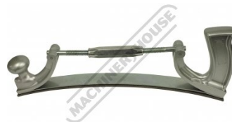
Shown with Optional File Front View Angle