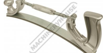
Shown with Optional File Top View Angle