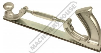
Shown With Optional File