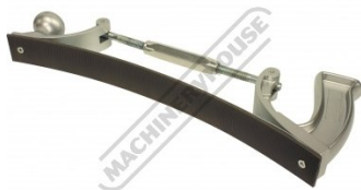
Shown with Optional File Bottom View Angle