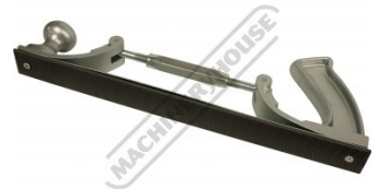
Shown with Optional File Bottom View