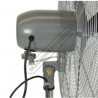
Motor Left View