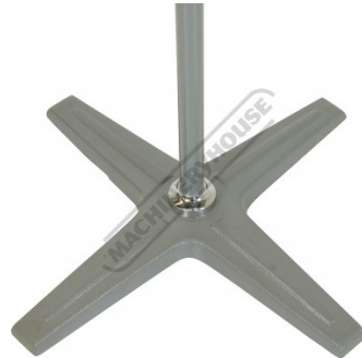
Cast Iron Base