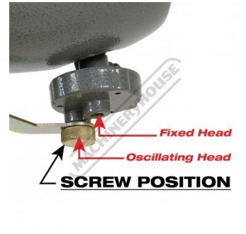
Fixed or Oscillating Screw Position