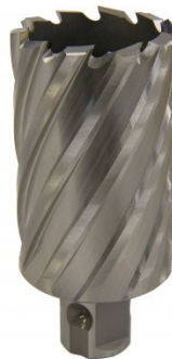
D9578 HSS Drill Broach Cutter