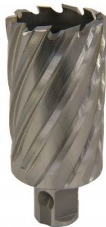
D9576 HSS Drill Broach Cutter