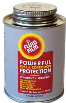
O043 Rust & Corrosion Preventive - Penetrant & Lubrication