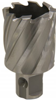
D9534 HSS Drill Broach Cutter