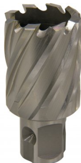
D9530 HSS Drill Broach Cutter