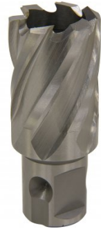
D9525 HSS Drill Broach Cutter