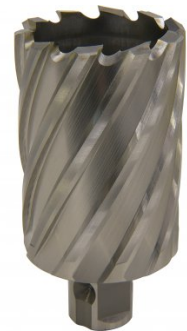
D9580 HSS Drill Broach Cutter