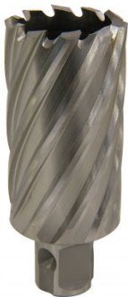
D9574 HSS Drill Broach Cutter