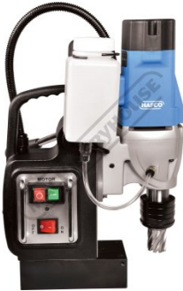
Side View & Control panel