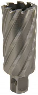
D9570 HSS Drill Broach Cutter