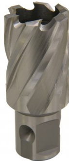
D9526 HSS Drill Broach Cutter