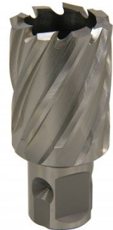
D9528 HSS Drill Broach Cutter