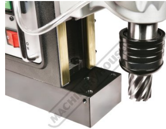
Quick Release Chuck (Cutter Not Included)