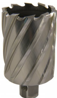
D9582 HSS Drill Broach Cutter