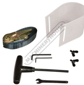
Tooling and Parts