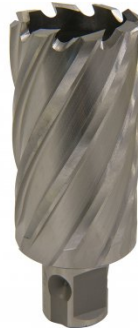
D9572 HSS Drill Broach Cutter