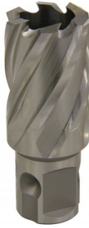
D9524 HSS Drill Broach Cutter