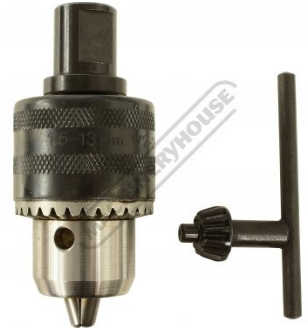
Includes Drill Chuck