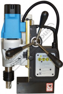
Rear Side View