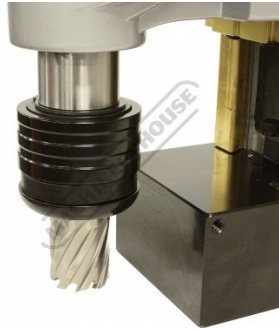
Quick Release Chuck - Cutter Not Included