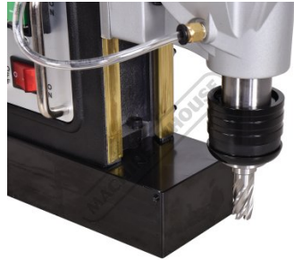
Quick Release chuck Cutter Not Included