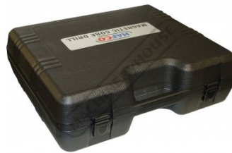
Plastic Carry Case